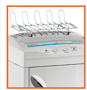
TOP SHELF (OPTION)

Power management system with illuminated indicators for power saving in stand-by mode