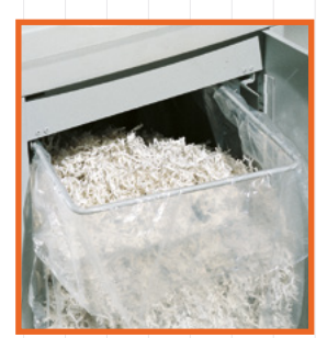
FRONT DOOR FOR EASY EMPTYING of collection bag (capacity of 1.000 sheets in straight cut)

CARBON HARDENED STEEL CUTTING KNIVES unaffected by staples and clips.