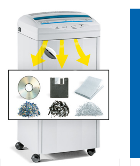
CERTIFICATION MARKS: CB - CSA - CE